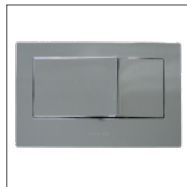
Right side: Oval panel